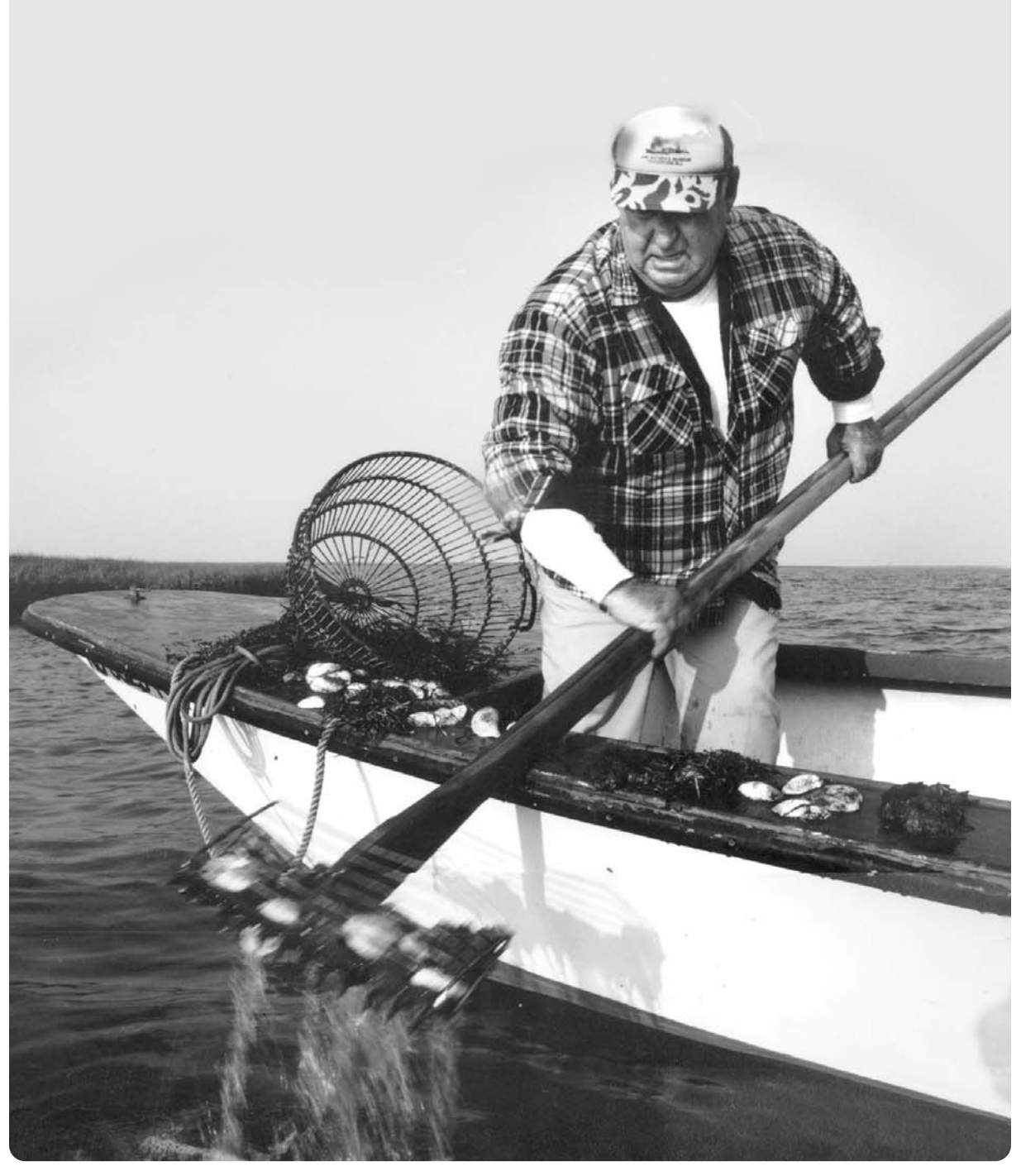
Harvesting Barnegat Bay Clams.